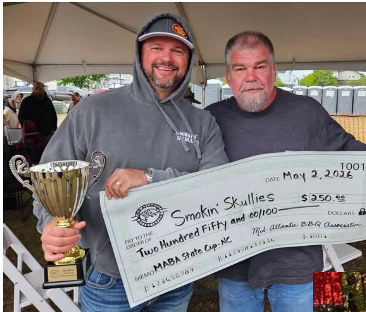
Smokin' Skullies BBQ won the MABA State Cup in NC at BEAR-B-Q in New Bern, NC on May 2, 2026.