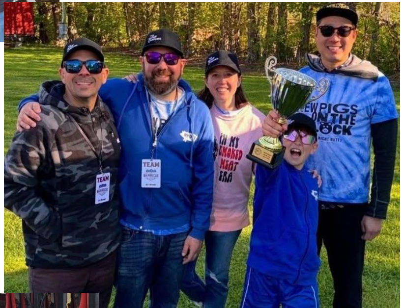
Poor Boys BBQ won the MABA State Cup in WV at the Almost Heaven BBQ Bash in Buckhannon, WV on June 20, 2026.